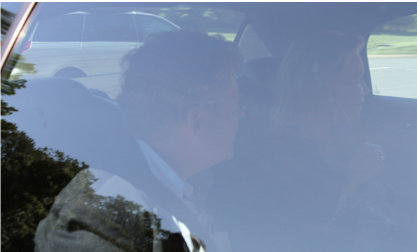
Jacob Wallenberg (and his wife) – Swedish Banker and Industrialist.