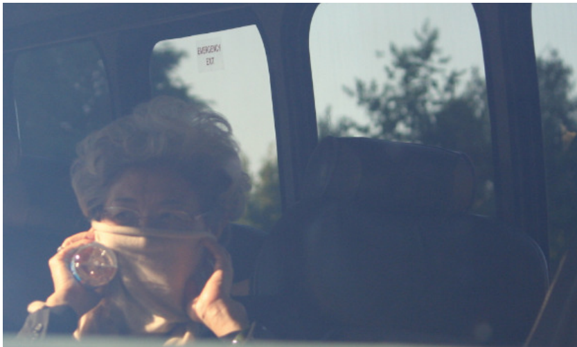
Ying Fu – Vice Minister of Foreign Affairs. (China)