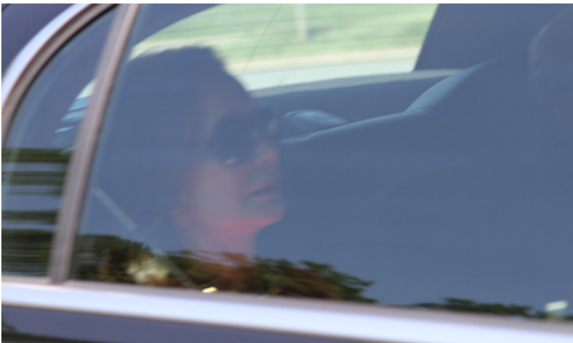
Alison Redford – Premier of Alberta, Canada.