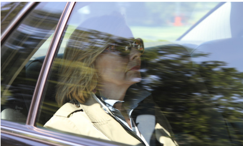
Jutta Urpilainen – Current Minister of Finance of Finland.