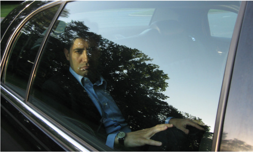
Kevin Warsh – Visiting fellow at Stanford University's Hoover Institution and former Federal Reserve Board of Governors Member.